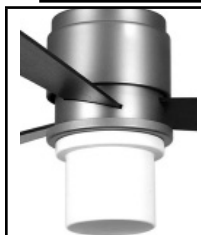
Optional Light Kit